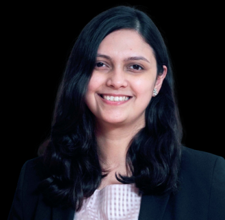
Conrad Sangma | Chief Minister, Meghalaya Imperial College London