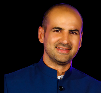
Neeraj Chopra | Reigning Olympic and World Champion, Men's Javelin Throw Loughborough University